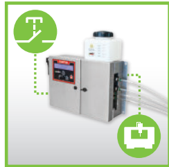
Control the Quantum™ with simple inputs or integrate fully through a robust serial interface.