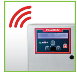
Active monitoring with alerts informs operators when critical issues arise.