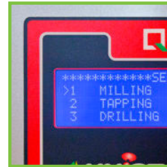
Setup, store, and select multiple jobs with the Quantum's™ simple user interface.