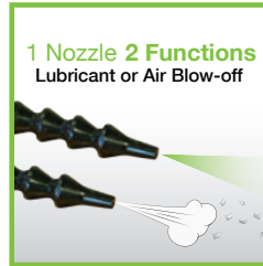
1 Nozzle 2 Functions Lubricant or Air Blow-off