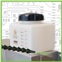
Quantify your lubrication with digitally controlled output.